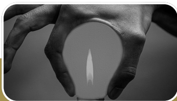
Discover Power Source

Then a hoe weapon sword appeared in his hands and he went forth attacking the first Prince by the hoe sword. Cutting of his head. And the second and the third Princes by the same hoe sword.