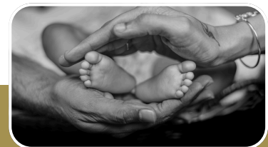
Flushing off shame